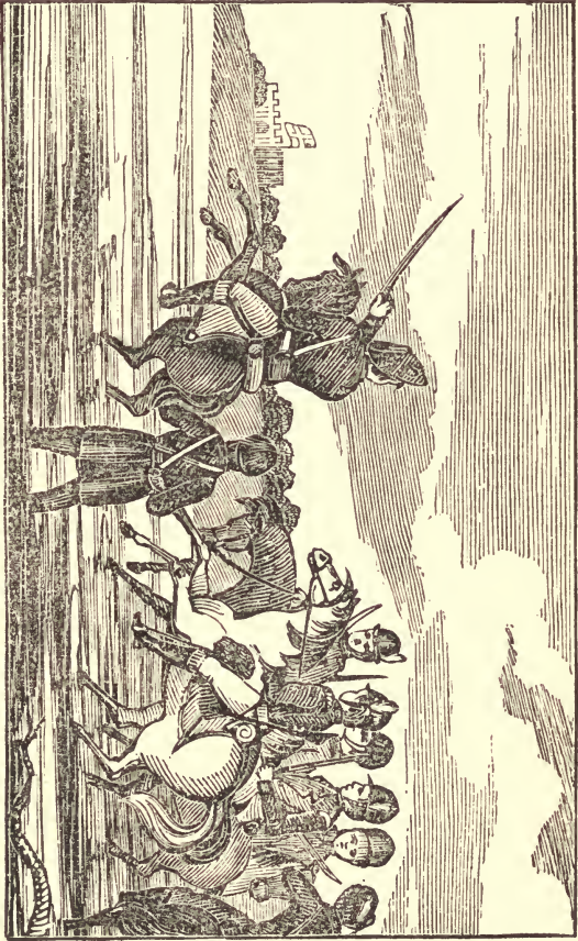
Marion and his brigade fording the river--page 101.